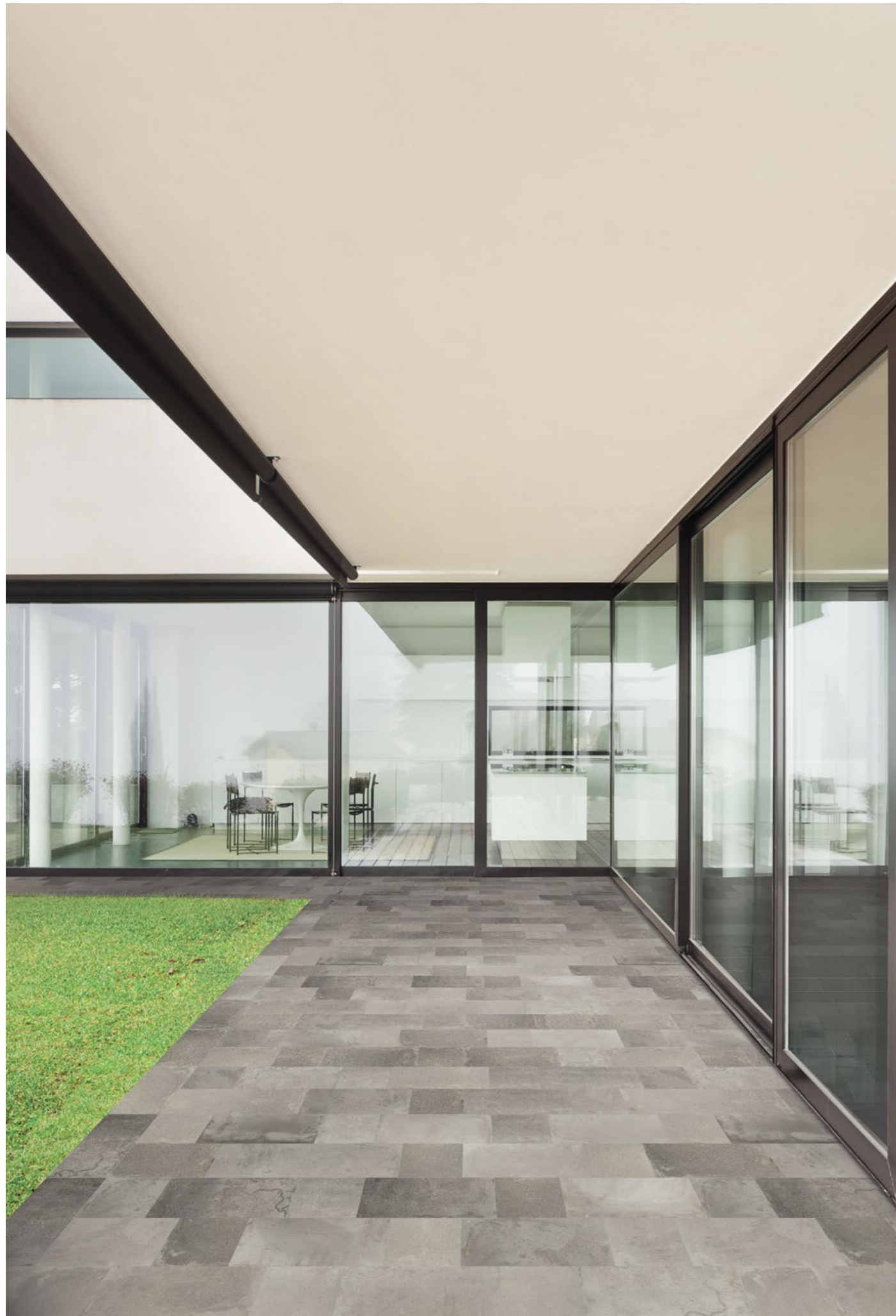
Ferro 21,6x43,5 & 21,6x21,6 R11