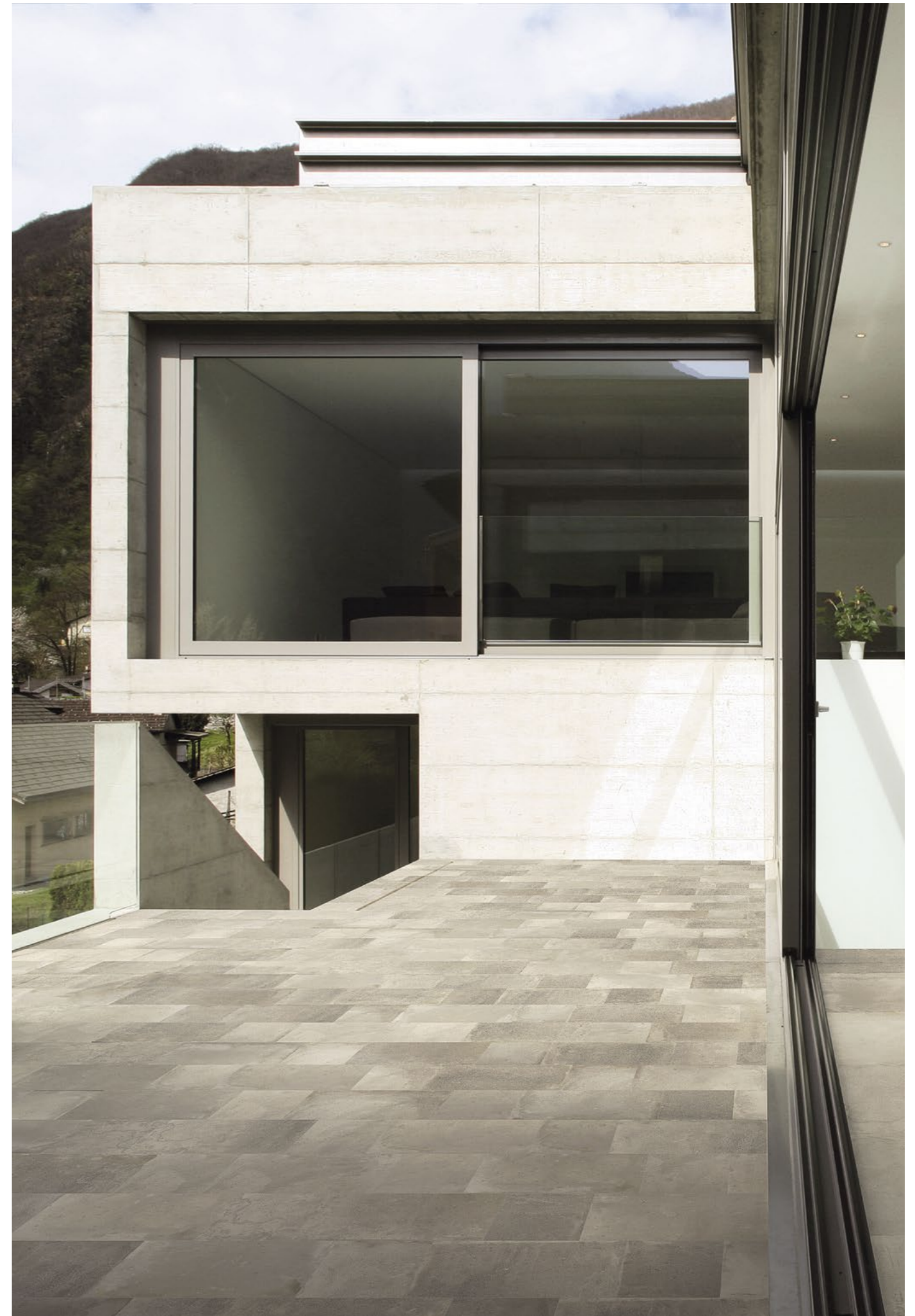
Taupe 21,6x43,5 & 21,6x21,6 R11