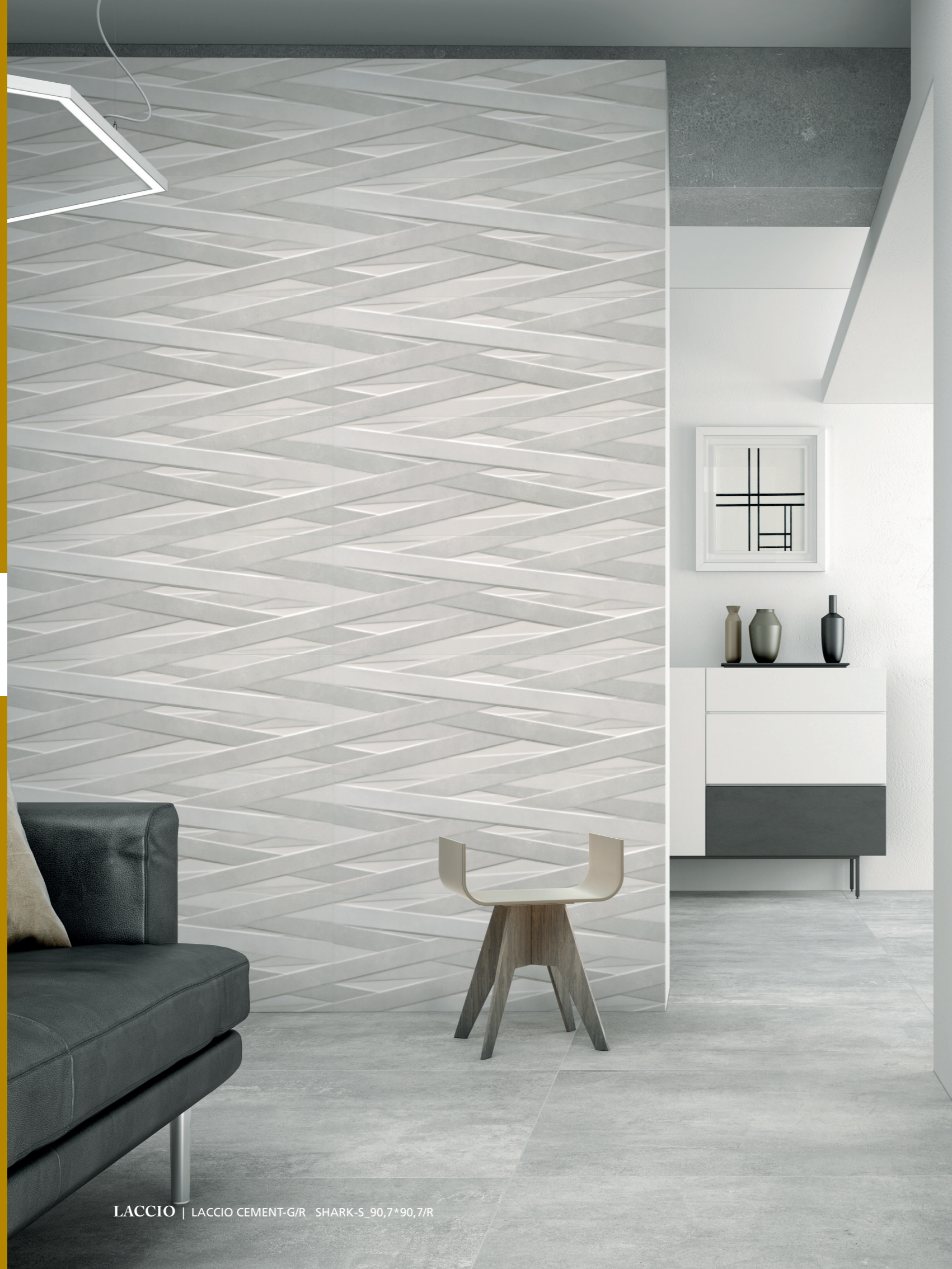
LACCIO | LACCIO CEMENT-G/R SHARK-S 90,7*90,7/R