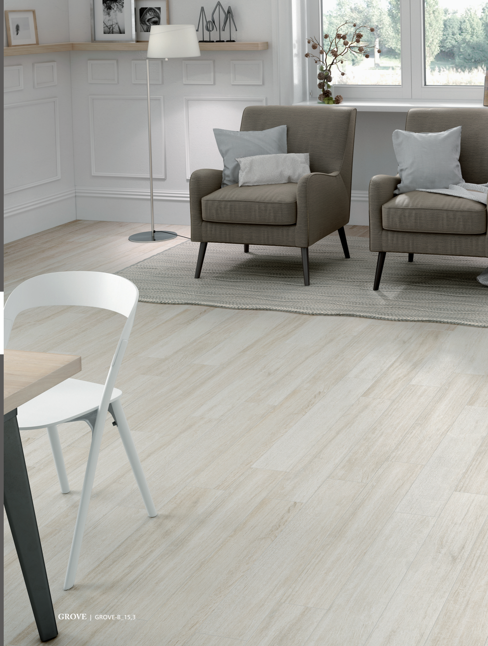
GROVE | GROVE-B_15,3