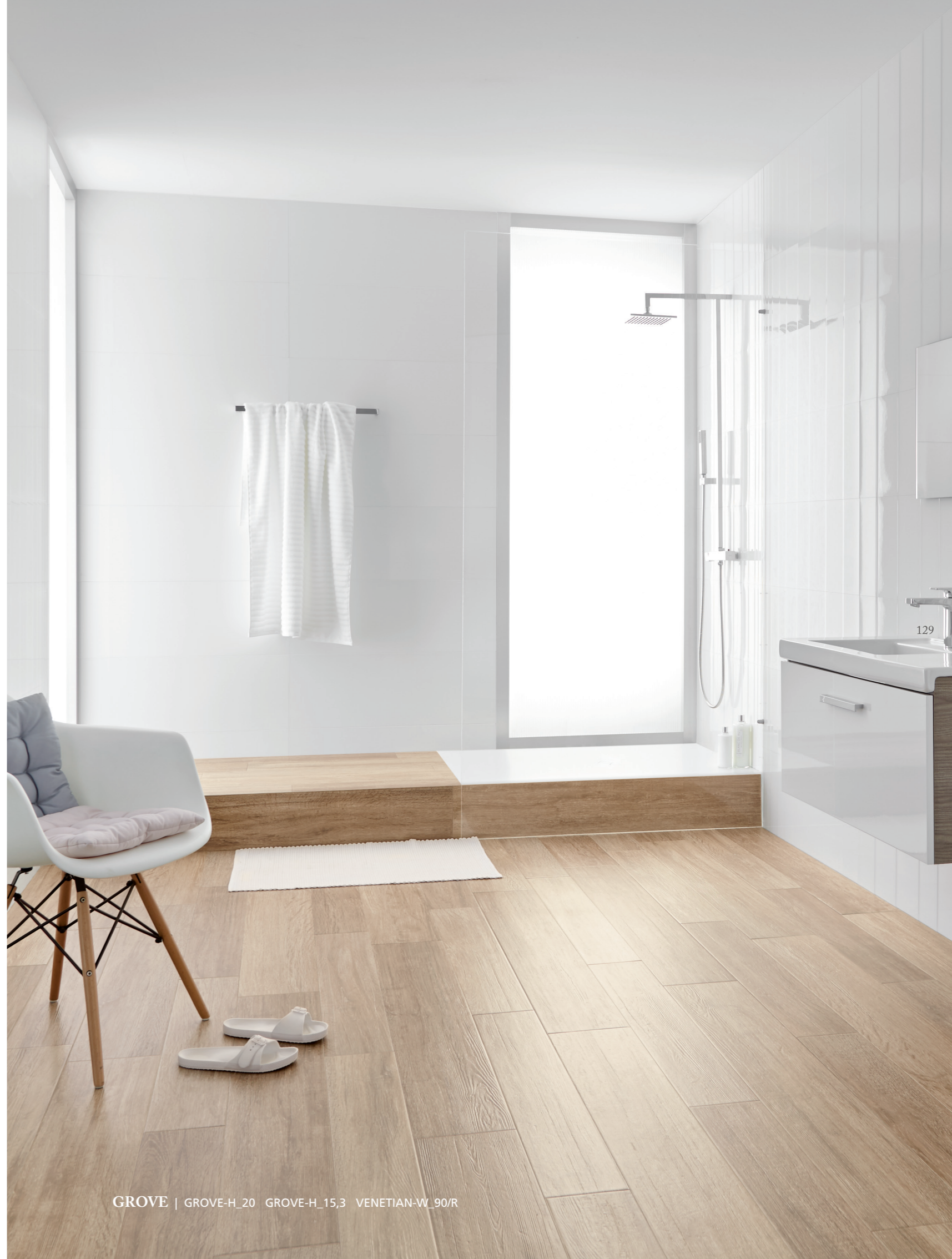
GROVE | GROVE-H_20 GROVE-H_15,3 VENETIAN-W_90/R