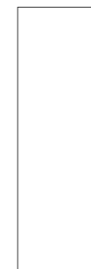
100x300 cm RECT 39"x118"