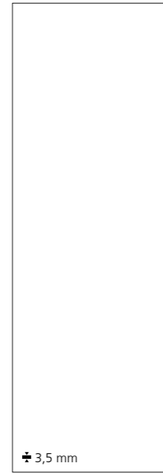
± 3,5 mm 100x300 cm RECT - 39"x118" NATURALE