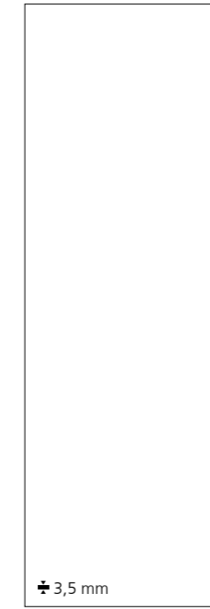
± 3,5 mm 100x300 cm RECT - 39"x118" NATURALE