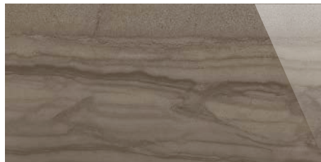
Carbon Rectified polished porcelain CS2141-6030 • 600 x 300 x 10mm 22.9kg per m 2 • PEI Rating: 3