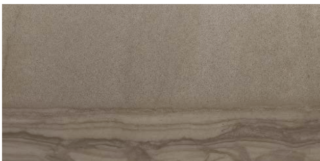
Carbon Rectified matt porcelain CS1063-9015 • 890 x 145 x 10mm CS1063-9022 • 890 x 220 x 10mm CS1063-9045 • 890 x 442 x 10mm 22.9kg per m 2 • PEI Rating: 3