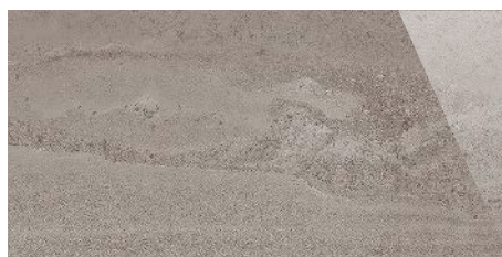
Grey Rectified polished porcelain CS2140-6030 • 600 x 300 x 10mm 22.9kg per m 2 • PEI Rating: 4