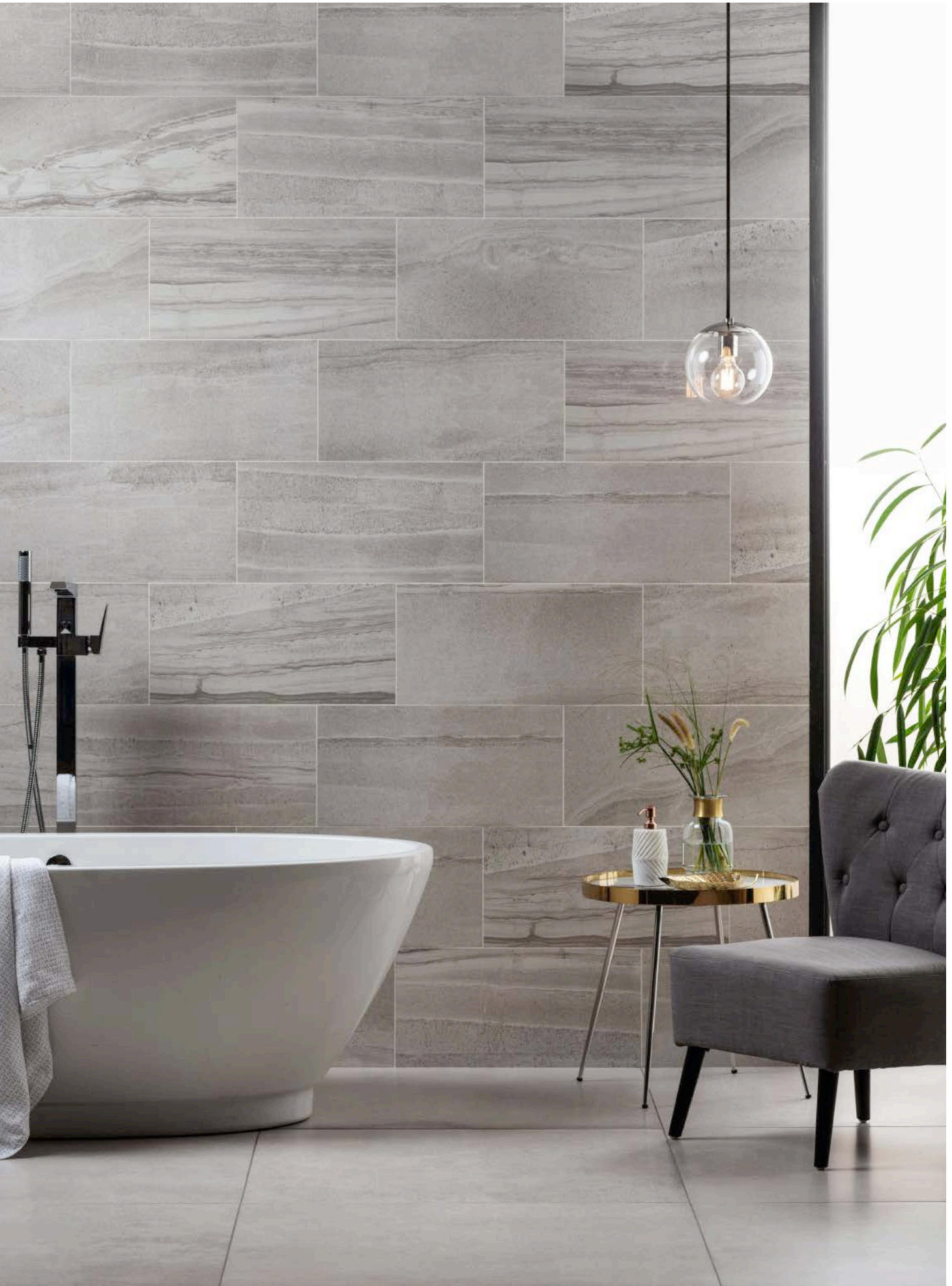
Wall: Amelia White polished CS2139-6030 Floor: Toronto Off White matt CS2154-9090 see page 92