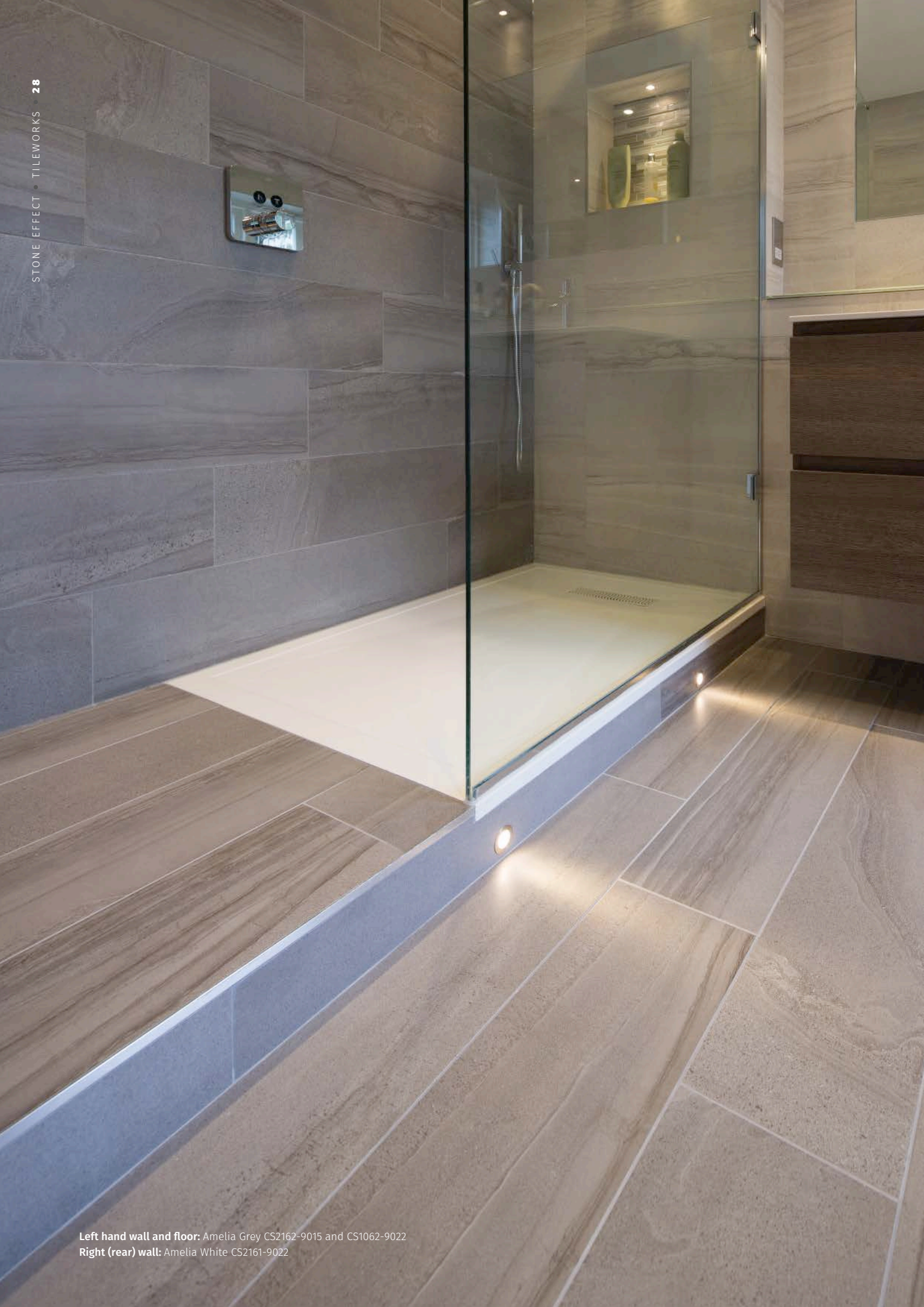
Left hand wall and floor: Amelia Grey CS2162-9015 and CS1062-9022 Right (rear) wall: Amelia White CS2161-9022