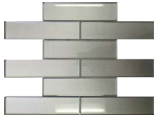
GALAXY PEWTER Code: C-06

Chip size: 50x200*8 mm, sheet size: 300x300 mm Material: Glass