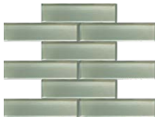
GALAXY ICE Code: C-08

Chip size: 50x200*8 mm, sheet size: 300x300 mm Material: Glass