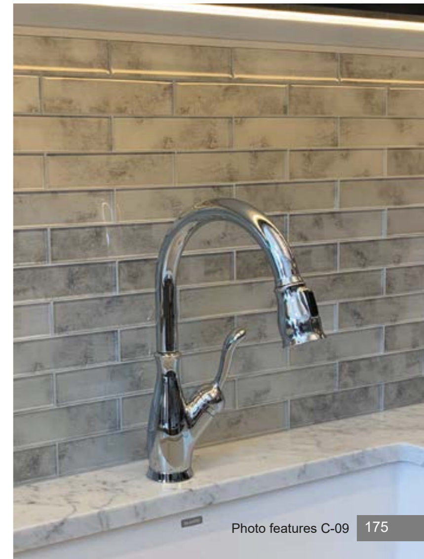
Photo features C-09 175