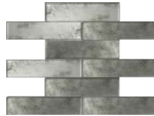
GALAXY ANTIQUE Code: C-09

Chip size: 50x200*8 mm, sheet size: 300x300 mm Material: Glass