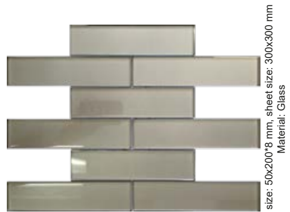
GALAXY ASH Code: C-03

Chip size: 50x200*8 mm, sheet size: 300x300 mm Material: Glass