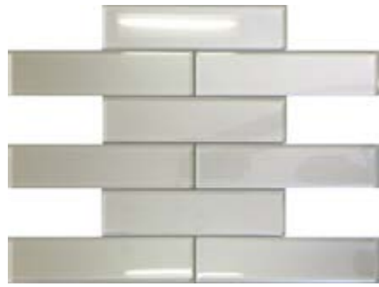
GALAXY SNOW Code: C-05

Chip size: 50x200*8 mm, sheet size: 300x300 mm Material: Glass