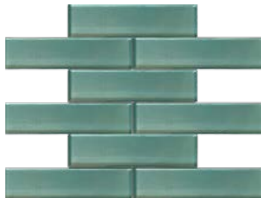
GALAXY AQUA Code: C-07

Chip size: 50x200*8 mm, sheet size: 300x300 mm Material: Glass