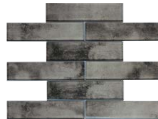
GALAXY SUEDE Code: C-11

Chip size: 50x200*8 mm, sheet size: 300x300 mm Material: Glass