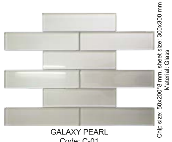
GALAXY PEARL Code: C-01

This stunning collection is a deep rich metallic look. Giving you just enough Glitz and Glam! This beautifully sized glass in six color options, works well with our other stone mosaics or alone. This collection is a must see in person. Take your peek into the Galaxy.