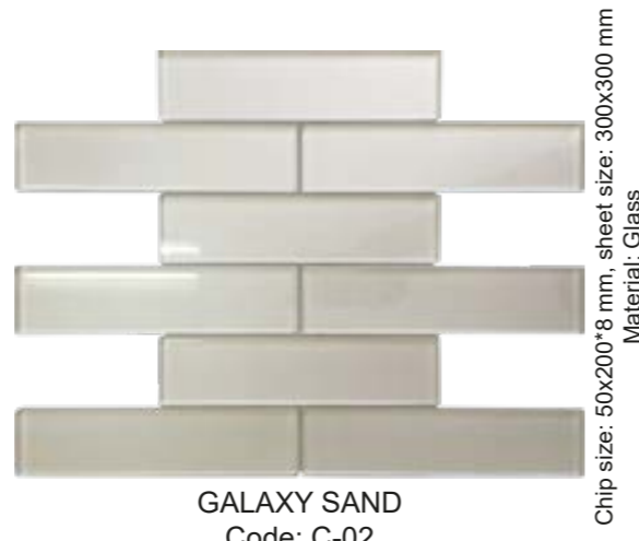
GALAXY SAND Code: C-02

Chip size: 50x200*8 mm, sheet size: 300x300 mm Material: Glass