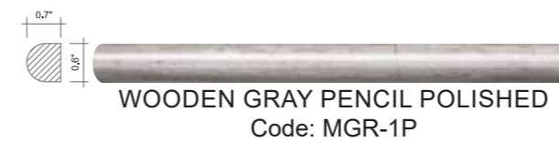
WOODEN GRAY PENCIL POLISHED Code: MGR-1P

Size: 15x18x305 mm Material: Wooden Gray