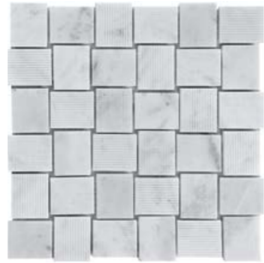
Sheet size: 277x277 mm Material: Bianco Carrara