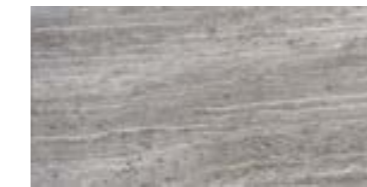
WOODEN GRAY 3x6 HONED Code: FGR-36H

Size: 75x150 mm Material: Wooden Gray Polished