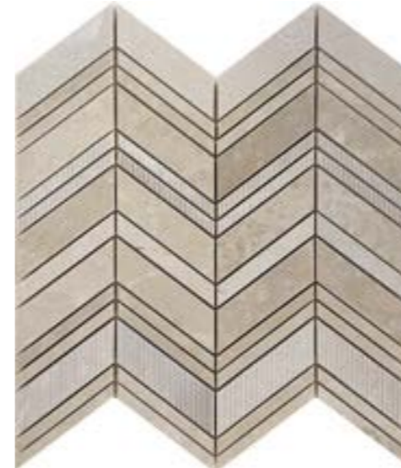
BALIAN CREMA Code: BL-07CM