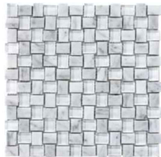
Sheet size: 300x300 mm Material: Bianco Carrara / Glass