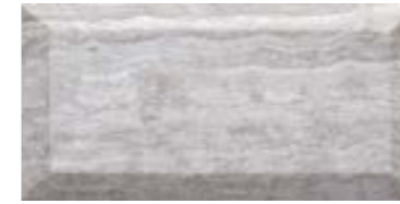
WOODEN GRAY 3x6 BEVELED AND POLISHED Code: FGR-36BP

Size: 75x150 mm Material: Wooden Gray Beveled and Polished