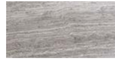
WOODEN GRAY 3x6 POLISHED Code: FGR-36P

Size: 75x150 mm Material: Wooden Gray Beveled and Polished