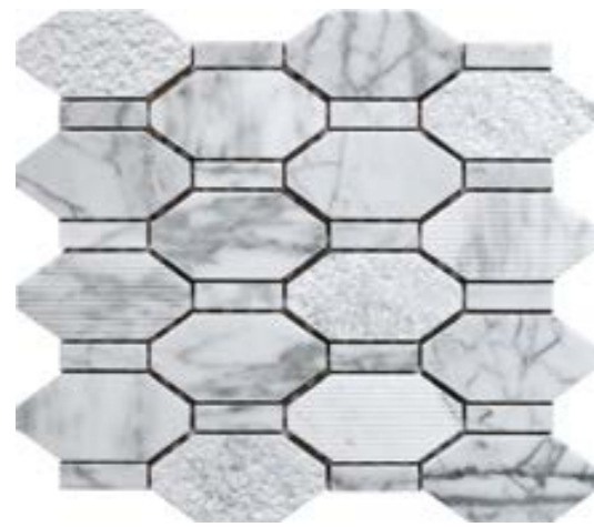
Sheet size: 279x310 mm Material: Bianco Carrara

A collection that will inspire a lush island living space anywhere with a special vibe and an essence, touched and inspired by Balinese influence. Mosaics of glass and stone combined with classic design, let in a warm and welcoming character. Textures, glass and stone all blended with 3 stone colors complete any designer's dream space.