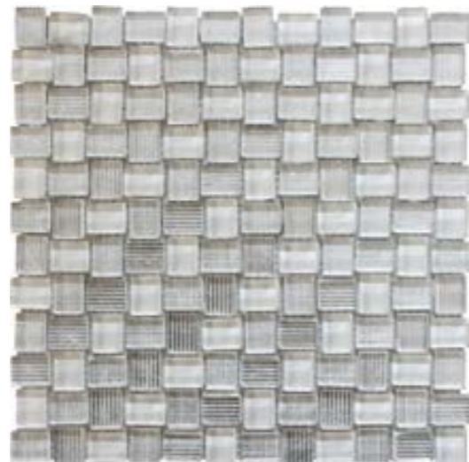
Sheet size: 300x300 mm Material: Glass