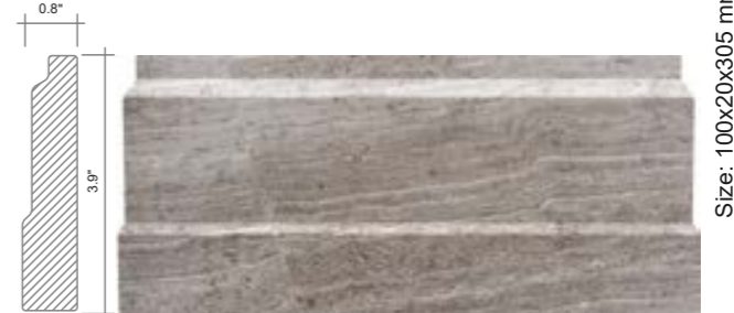
WOODEN GREY METRO BASE Code: MGR-6P

Size: 50x20x305 mm, 20x20x305 mm Material: Wooden Gray