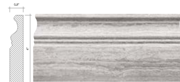
WOODEN GRAY BASE POLISHED Code: MGR-3P

Size: 50x25x305 mm Material: Wooden Gray