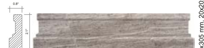
WOODEN GREY METRO RAIL Code: MGR-5P

Size: 15x18x305 mm Material: Wooden Gray