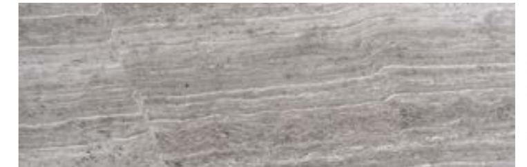
WOODEN GRAY 4x12 POLISHED Code: FGR-412P

Size: 75x150 mm Material: Wooden Gray Honed