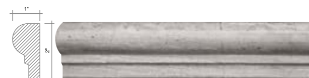
WOODEN GRAY CHAIR RAIL POLISHED Code: MGR-2P

Size: 15x18x305 mm Material: Wooden Gray