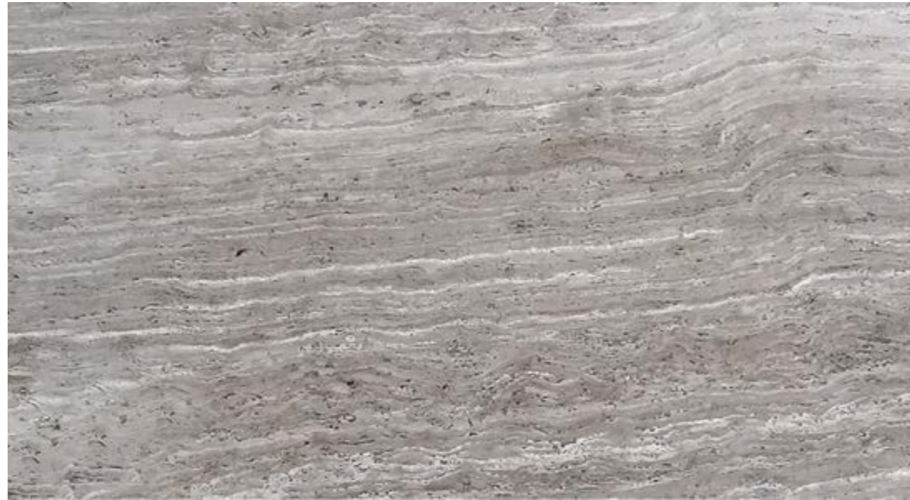
WOODEN GRAY 12x24 POLISHED Code: FGR-1224P