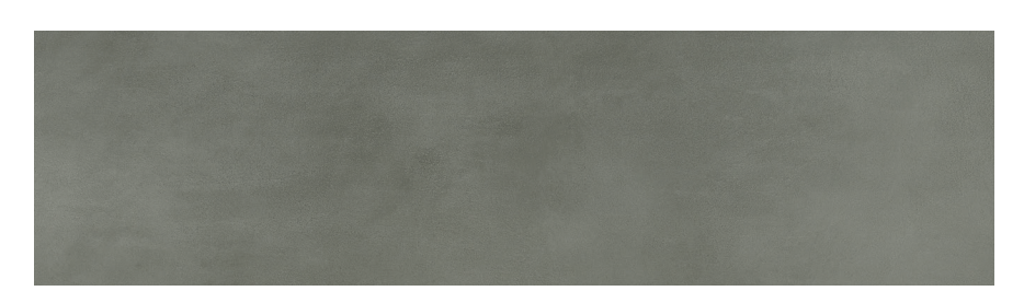
Antracite - F6373 - 3+ (Walls)- Stocking