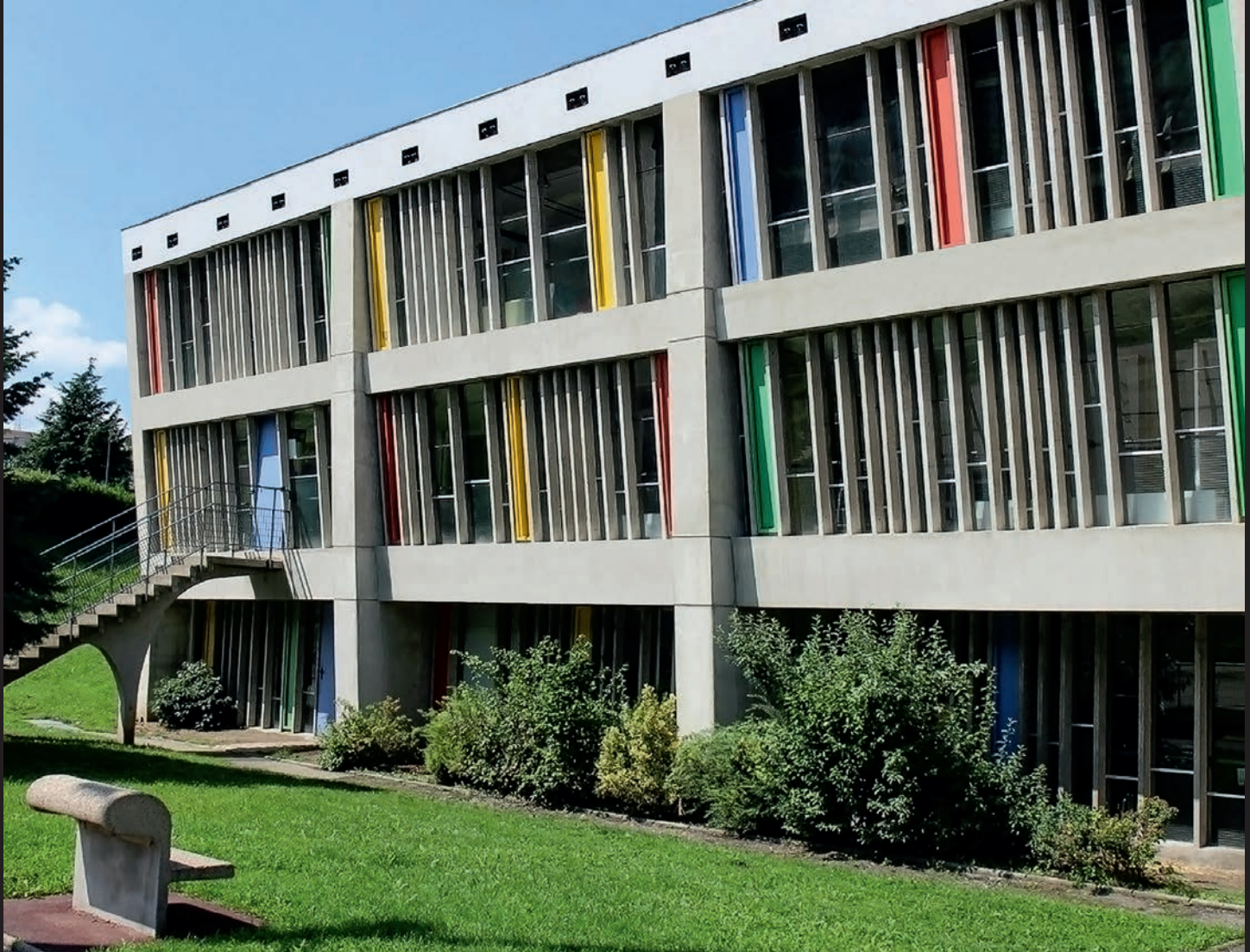
Maison des Jeunes et de la Culture - Firminy France - 1953 ©