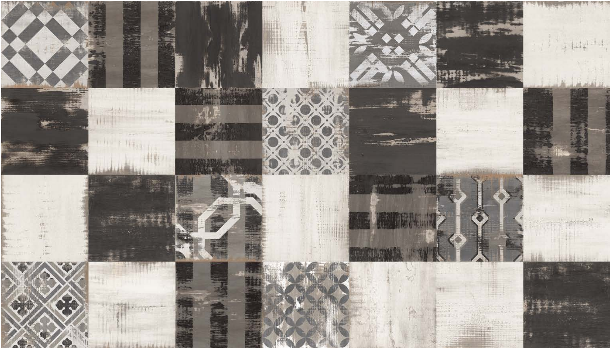
DCWHS03 CRAFTSMAN WOOD HAMPTONS DARK 25x25 10"x10"