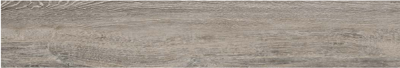
DCW1290 CRAFTSMAN WOOD MUD 20x120 8"x48"