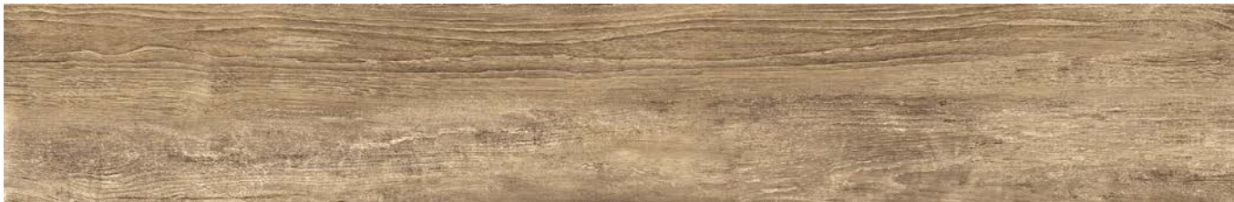
DCW1220 CRAFTSMAN WOOD HONEY 20x120 8"x48"