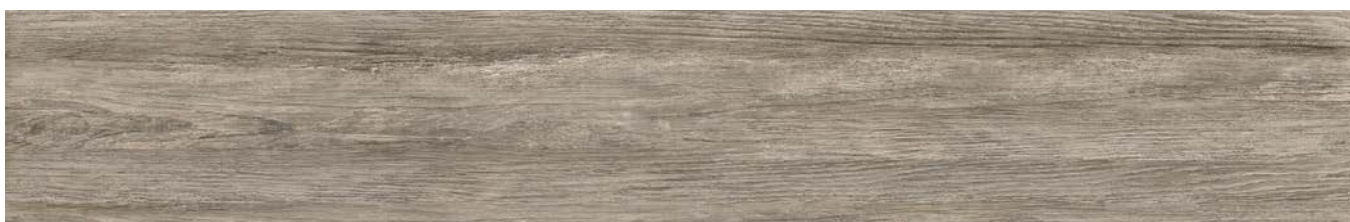
DCW1290E CRAFTSMAN WOOD MUD Extérieure 20x120 8"x48"