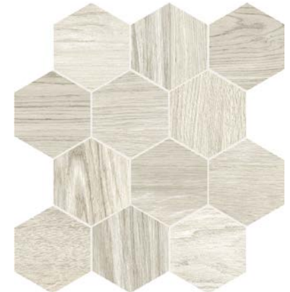
DCWEM10 CRAFTSMAN WOOD WHITE ESAGONA MIX (T. 12) 35x37,5 13,8"x14,8"