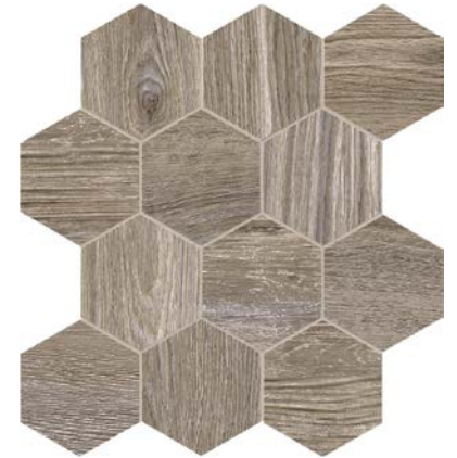
DCWEM90 CRAFTSMAN WOOD MUD ESAGONA MIX (T. 12) 35x37,5 13,8"x14,8"