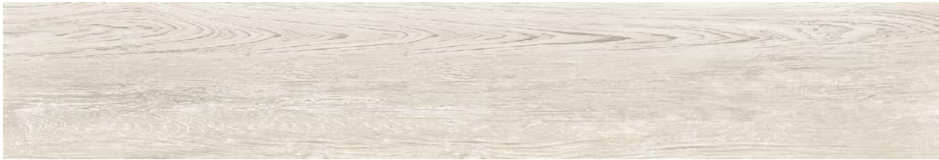
DCW1210 CRAFTSMAN WOOD WHITE 20x120 8"x48"