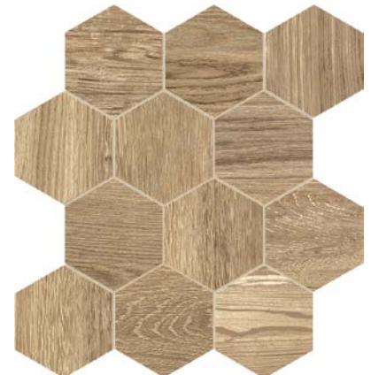
DCWEM20 CRAFTSMAN WOOD HONEY ESAGONA MIX (T. 12) 35x37,5 13,8"x14,8"