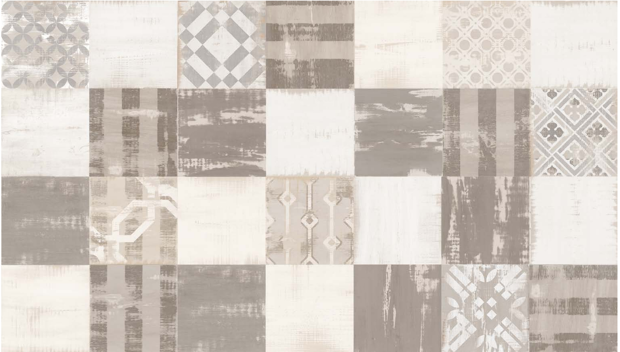
DCWHS02 CRAFTSMAN WOOD HAMPTONS MEDIUM 25x25 10"x10"