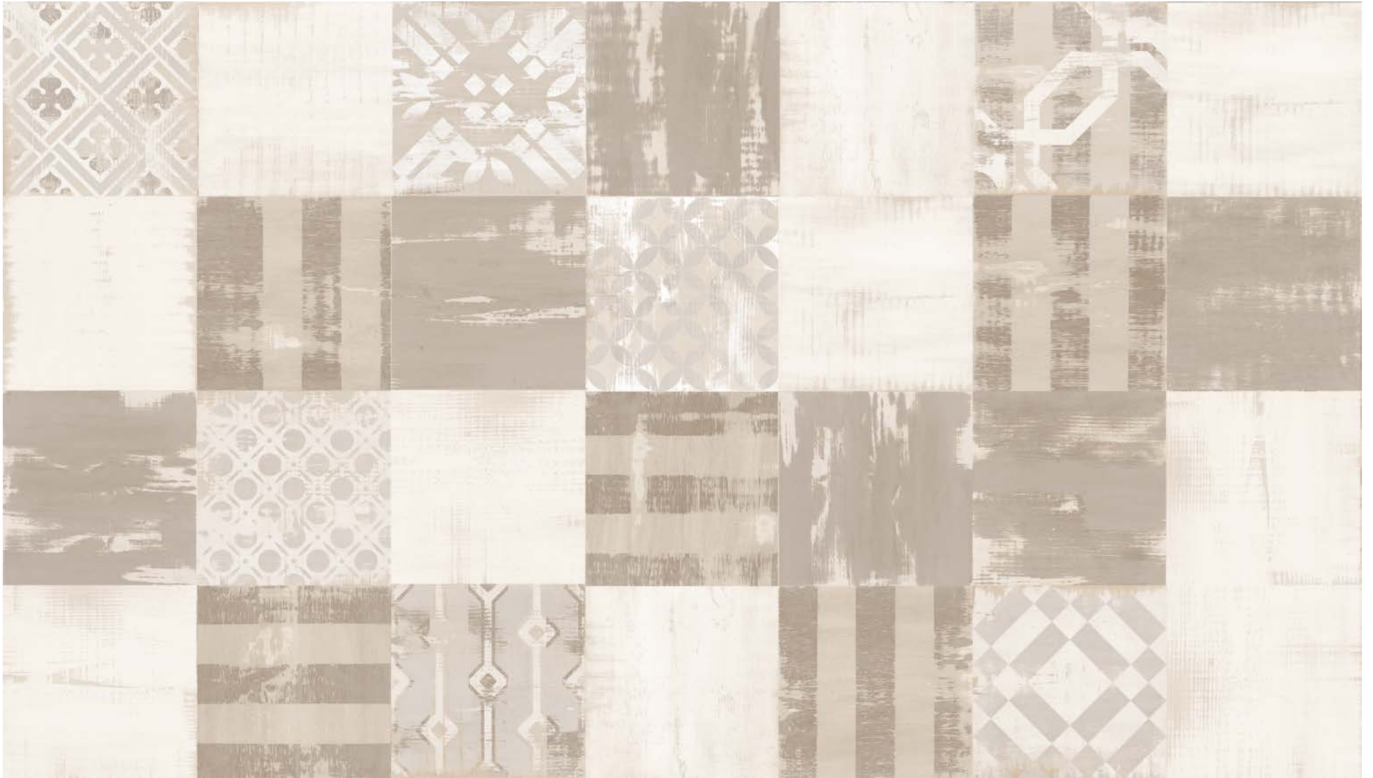
DCWHS01CRAFTSMAN WOOD HAMPTONS LIGHT 25x25 10"x10"