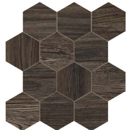
DCWEM70 CRAFTSMAN WOOD COAL ESAGONA MIX (T. 12) 35x37,5 13,8"x14,8"