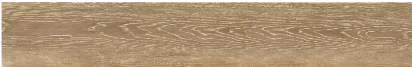
DCW1220E CRAFTSMAN WOOD HONEY Extérieure 20x120 8"x48"