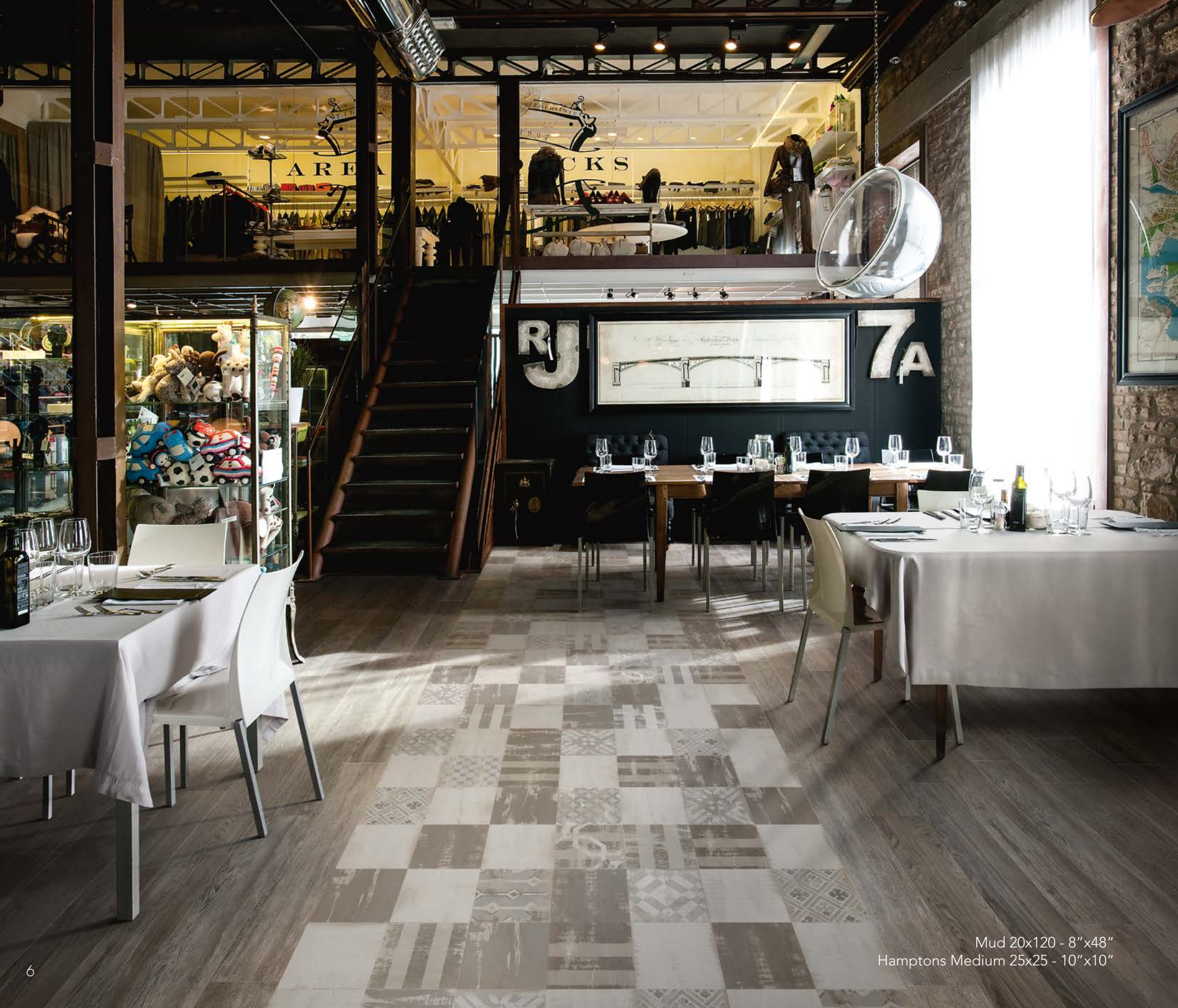
Mud 20x120 - 8"x48" Hamptons Medium 25x25 - 10"x10"