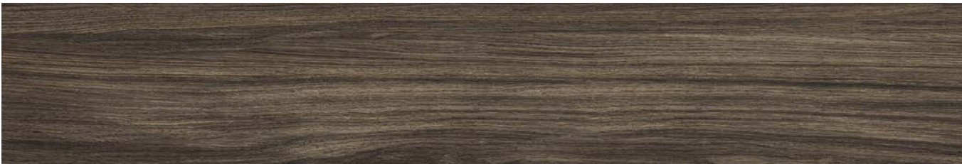
DCW1270 CRAFTSMAN WOOD COAL 20x120 8"x48"