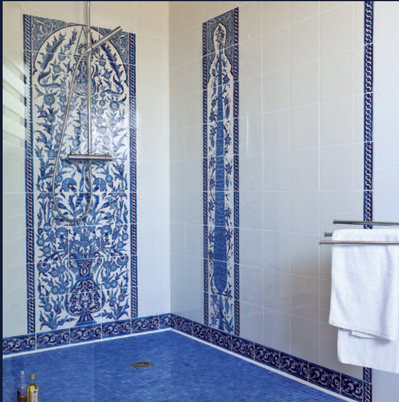
MURALS 25 x 180 cm