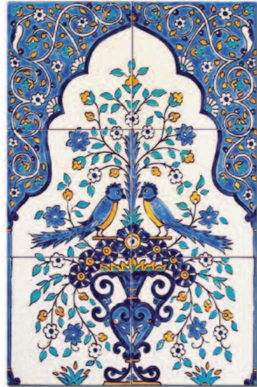
SHALIMAR (Ivory background) - 6 tiles 20 x 20 cm DOFHAL001 9A S