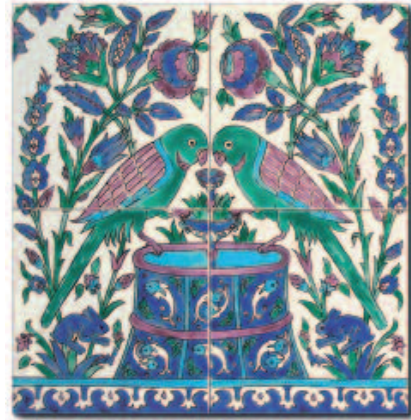
MURAL 40 x 40 cm

60 x 100 cm - 100 x 100 cm - 40 x 40 cm Thickness: 8 mm