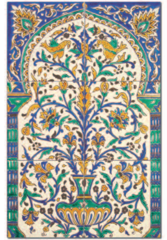
KALLALINE ARTISANAL (Ivory background) - 6 tiles 20 x 20 cm DOFKAAR001 9A S