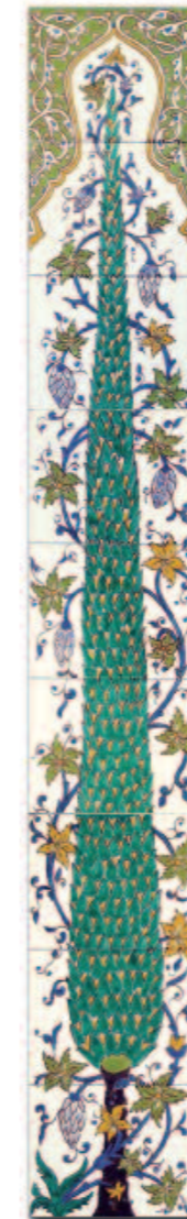
GREEN CYPRESS (Ivory background) 9 tiles 20 x 25 cm DOFCYVE002 10A S