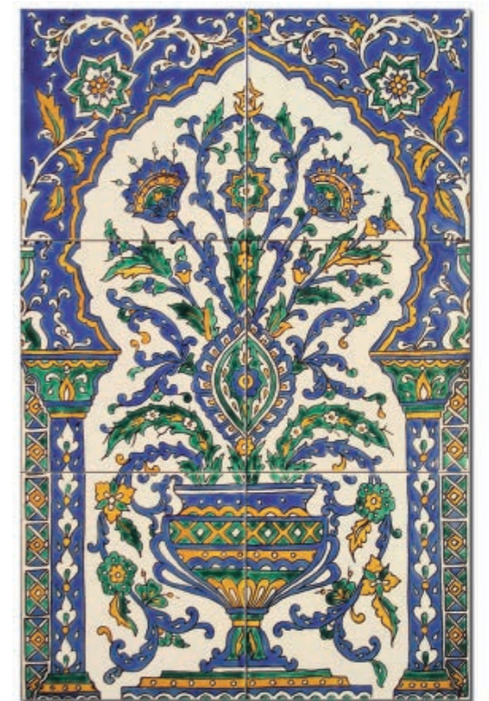
BOUQUET ARTISANAL (Ivory background) - 6 tiles 20 x 20 cm DOFBOAR001 9A S