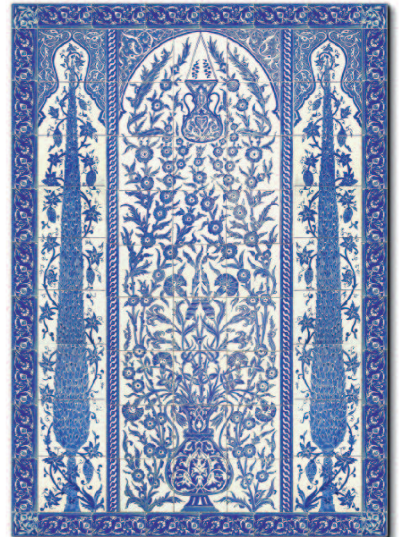
YAKOUT (Ivory background) - 27 tiles 20 x 20 cm DOFYAK0001 13A S