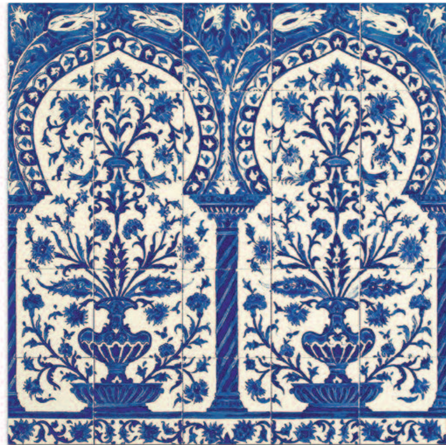
MURAL 100 x 100 cm

KINZ BLUE (Ivory background) 25 tiles 20 x 20 cm DOFKIBL001 12A S