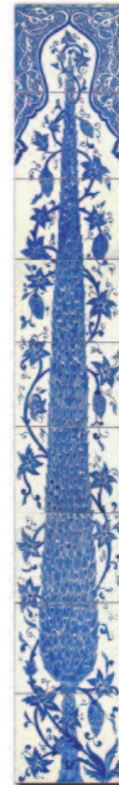
BLUE CYPRESS (Ivory background) 9 tiles 20 x 25 cm DOFCYBL002 10A S