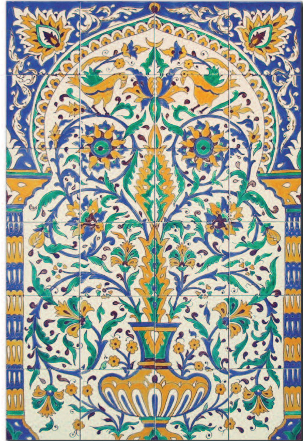
MURAL 80 x 120 cm

KALLALINE (Ivory background) 24 tiles 20 x 20 cm DOFKALL001 12A S