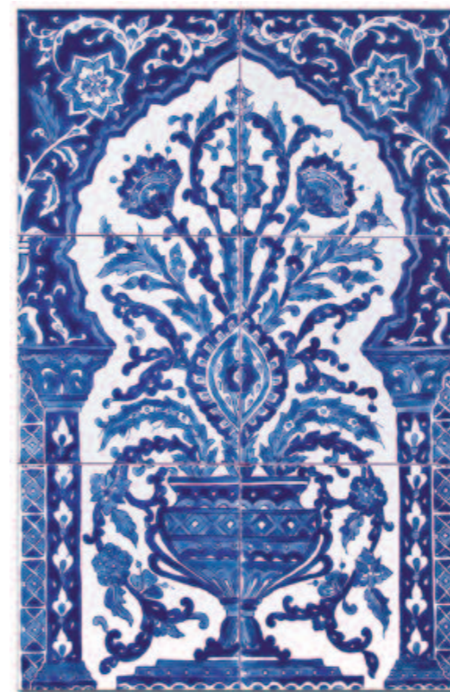
BOUQUET BLUE - 6 tiles 20 x 20 cm DOFBOBL001 9A S