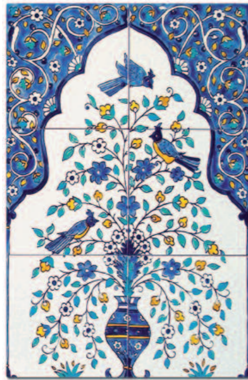
MIRAMAR (Ivory background) - 6 tiles 20 x 20 cm DOFMIRA001 9A S