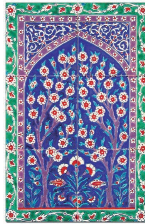
CHERRY TREE (Ivory background) - 6 tiles 20 x 20 cm DOFCERI001 9A S