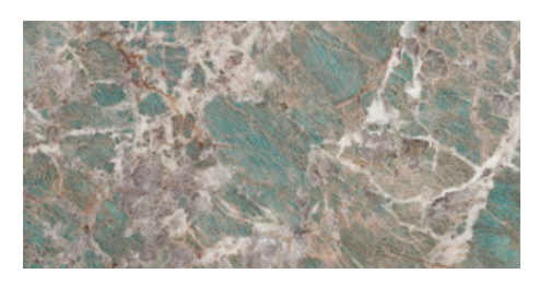
AMAZZONITE JADE PUL RECT G.155 | Porcelain tiles | POLISHED GRANILLA | Neutral Body Rectified.