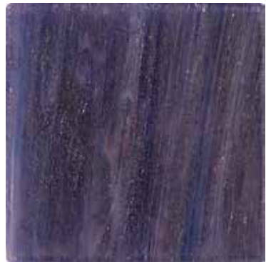
GM 50.53 Fillgel plus 6603