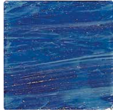
GM 50.59 Fillgel plus 7702