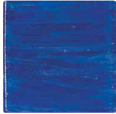
SM 50.06 Fillgel plus 7702