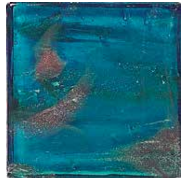
GM 50.49 Fillgel plus 8801