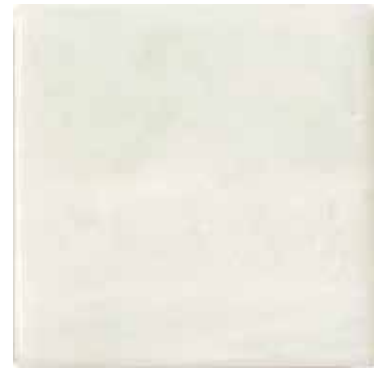
SM 50.01 Fillgel plus 1101