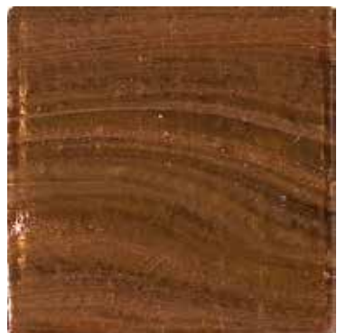
GM 50.97 Fillgel plus 4407