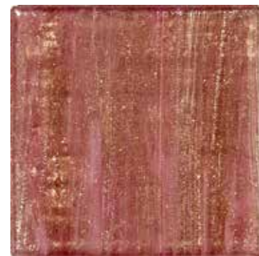
GM 50.11 Fillgel plus 6601