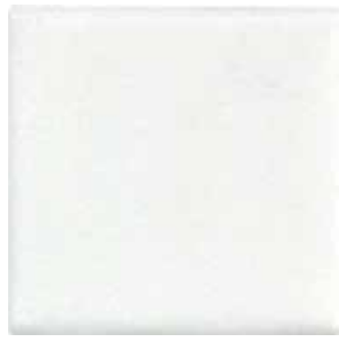
VTC 50.10 Fillgel plus 1101