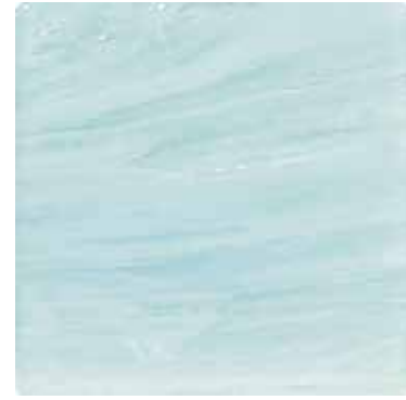
SM 50.21 Fillgel plus 7704