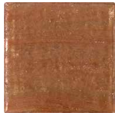
GM 50.10 Fillgel plus 4405