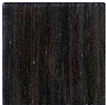
GM 50.77 Fillgel plus 2201