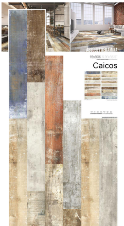
PE CAICOS 15X90 (100.5X192.5)